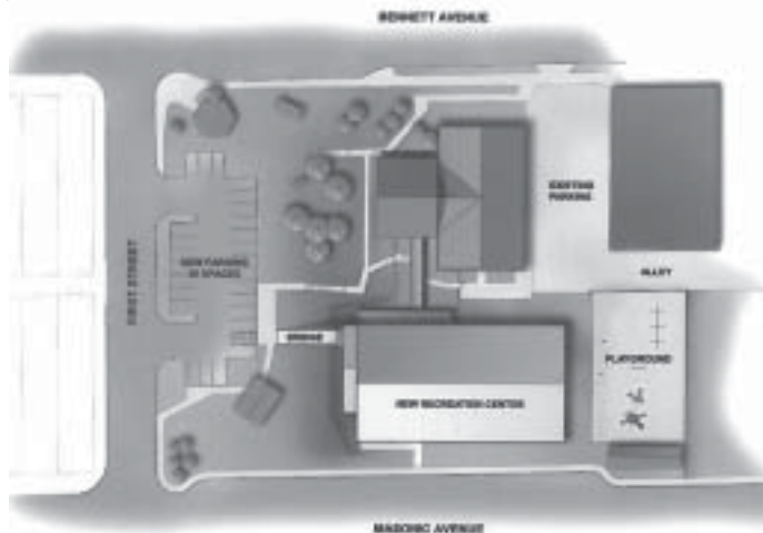
Proposal for the Cripple Creek Recreation Center Expansion

During the permitting process for the Mine Life Extension, the City of Cripple Creek identified several projects that they considered a priority for the community. One of these was an expansion of the current recreation center. Cripple Creek has completed architectural drawings and preliminary construction bids for the project. The Council has included funds for the Center in the 2011 budget, and CC&V has pledged $100,000 to the City for this project. The City currently has the final approval of the construction on hold, pending resolution of several revenue concerns. CC&V is hopeful that the recreation center expansion will move forward, and construction will begin in 2011.