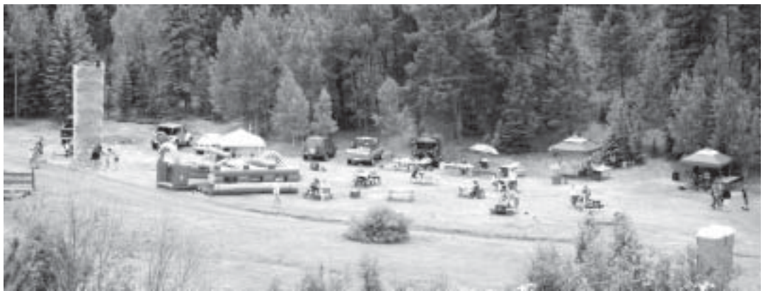
Looking out over the picnic area in The Lost Burro Campground

Preserving an endangered species... THE COLORADO MINER!