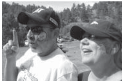
Face painting was a hit with the kids and the adults, showing everything from their favorite animals to their favorite football team.