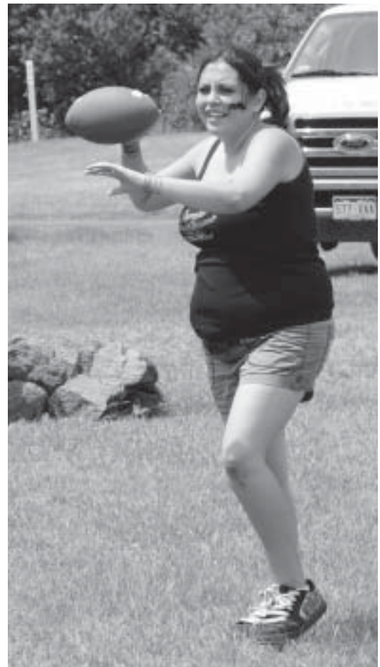
Baseball, football, frisbee, the picnic had it all..