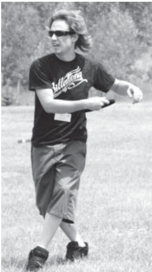
It was a great day for frisbee.